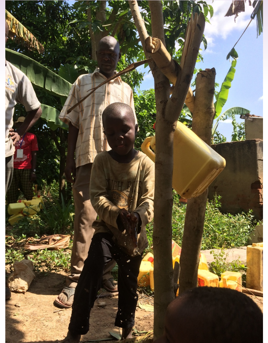
One team worked on the tippy taps and handwashing sensitization