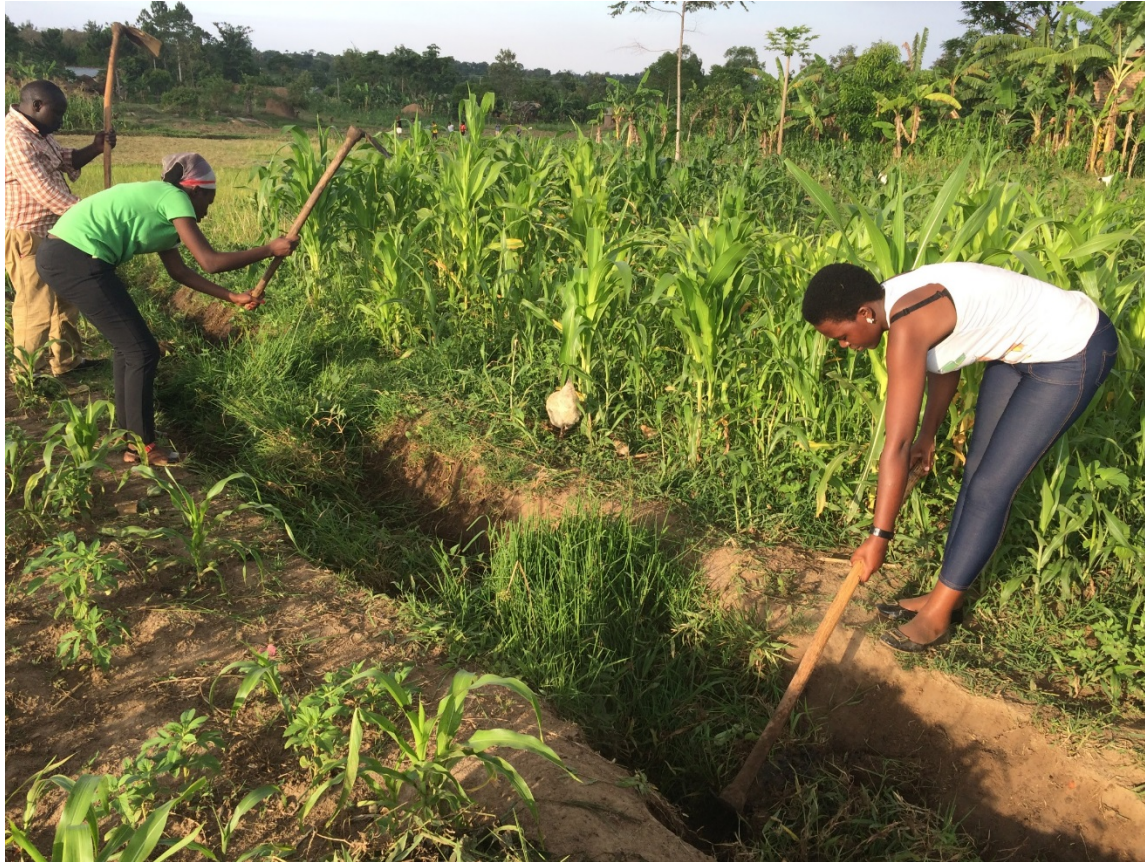
Tusenvule members cleaning and digging the blocked drainage channel

⇒ WORK BEGAN BY CLEANING THE DRAINAGE CHANNEL